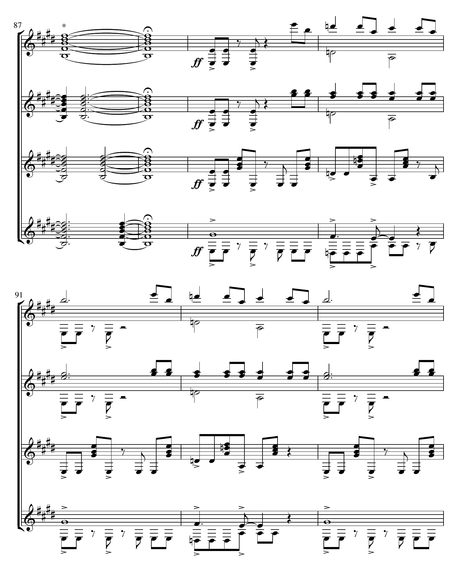
*Guitar 1 - m. 87 - Strum chord with thumb gently, using the flesh, not the nail.