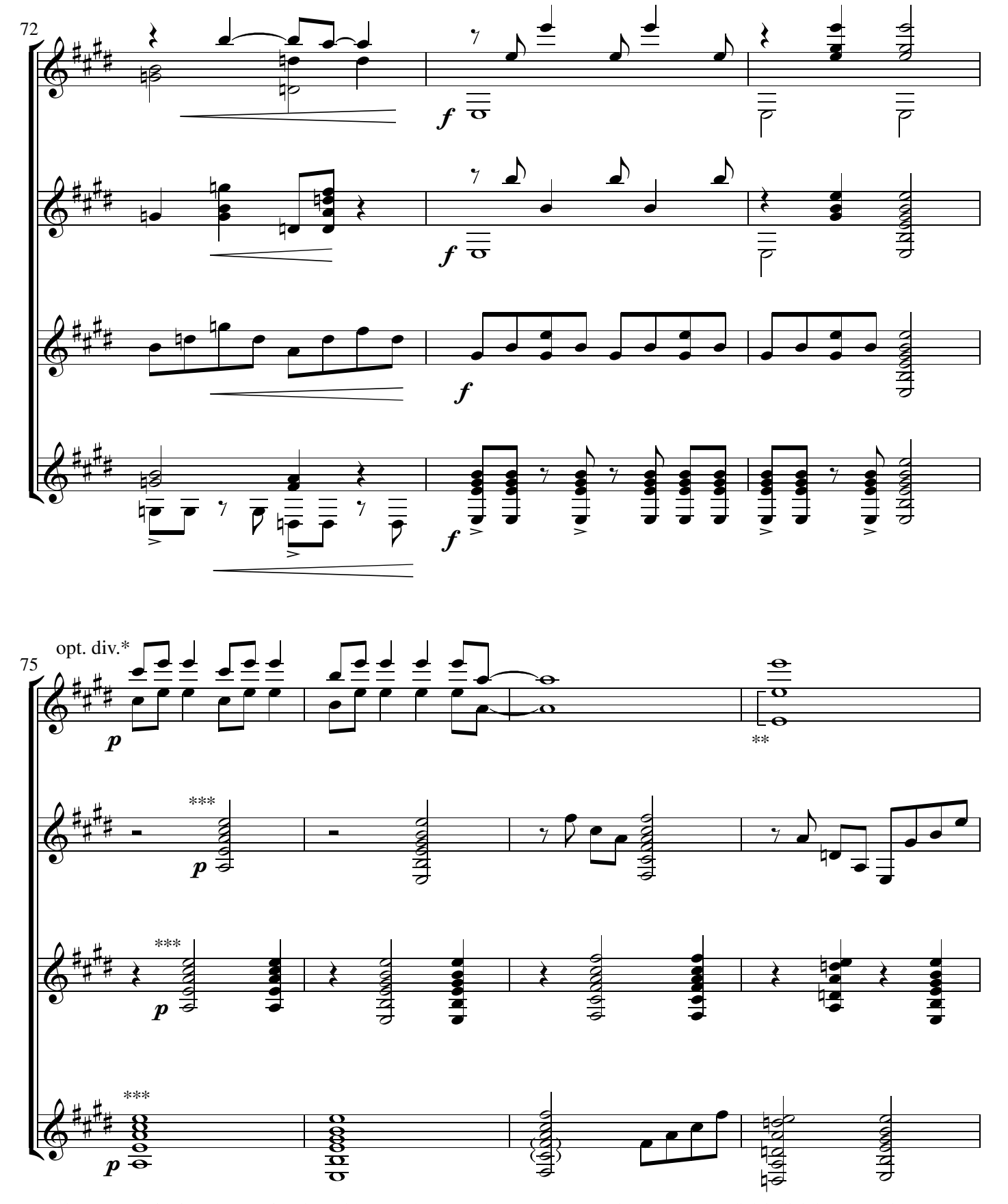
*Guitar 1 - m. 75-85 - When performing with more than one player on a part, Guitar 1 may play divisi, dividing according to stem direction. When performing with one player, choose either part (upper part recommended but more challenging). **Lower part play the bottom two notes in m. 78 and m. 82.